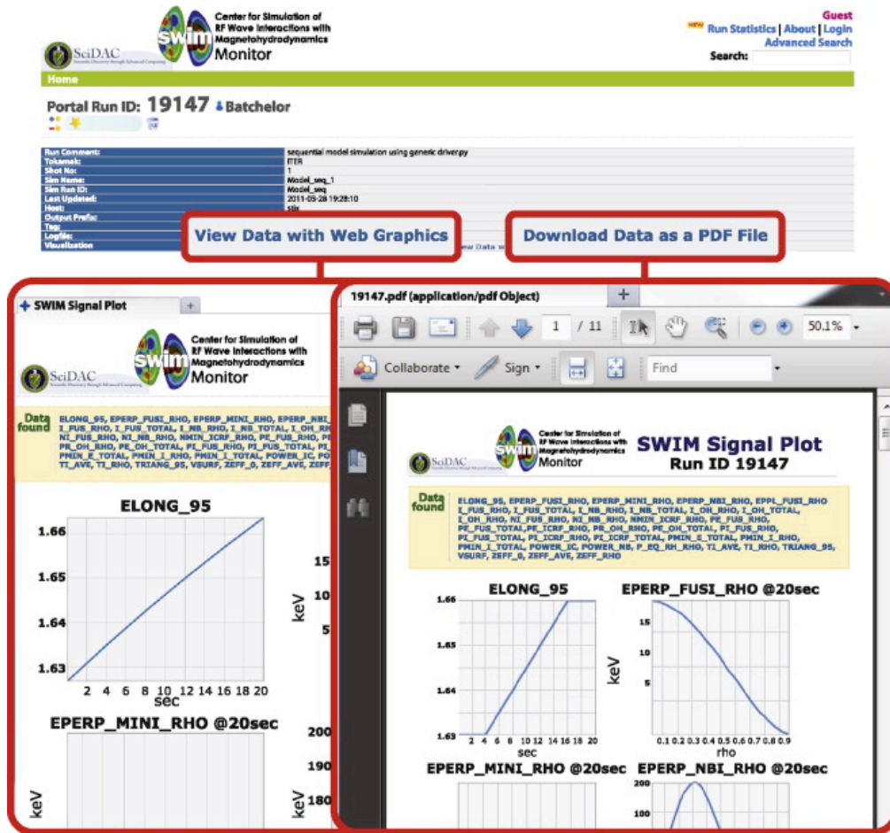
Figure -3 SWIM monitoring portal provides real-time, interactive signal plots.