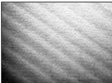
Fig. 2: Plastic film with \sin(x) perturbation ( 0.25\ \mu\text{m} amplitude and 12.5\ \mu\text{m} period).

During the past month we have completed layering at Schafer Corp. of patterned silicon-doped target films for LLE. This is film which has been produced in several steps: a poly ( \alpha -methylstyrene) (PAMS) layer approximately 100 microns thick was cast on an appropriate silica \sin(x) patterned substrate ( \lambda = 30 microns, A = 1 micron); the PAMS film was sent to GA for coating with a layer of glow discharge polymer (GDP) silicon-doped film which was about 5 microns thick; the composite layer was returned to Schafer and an additional layer of silicon-doped polymer was applied to bring the thickness of silicon-doped material to 20 microns and to produce a smooth top surface (unpatterned). We are in the process of decomposing the PAMS layer by heating to 300^\circ\text{C} to leave the silicon-doped material with the \sin(x) pattern. This is a newly developed technique and will